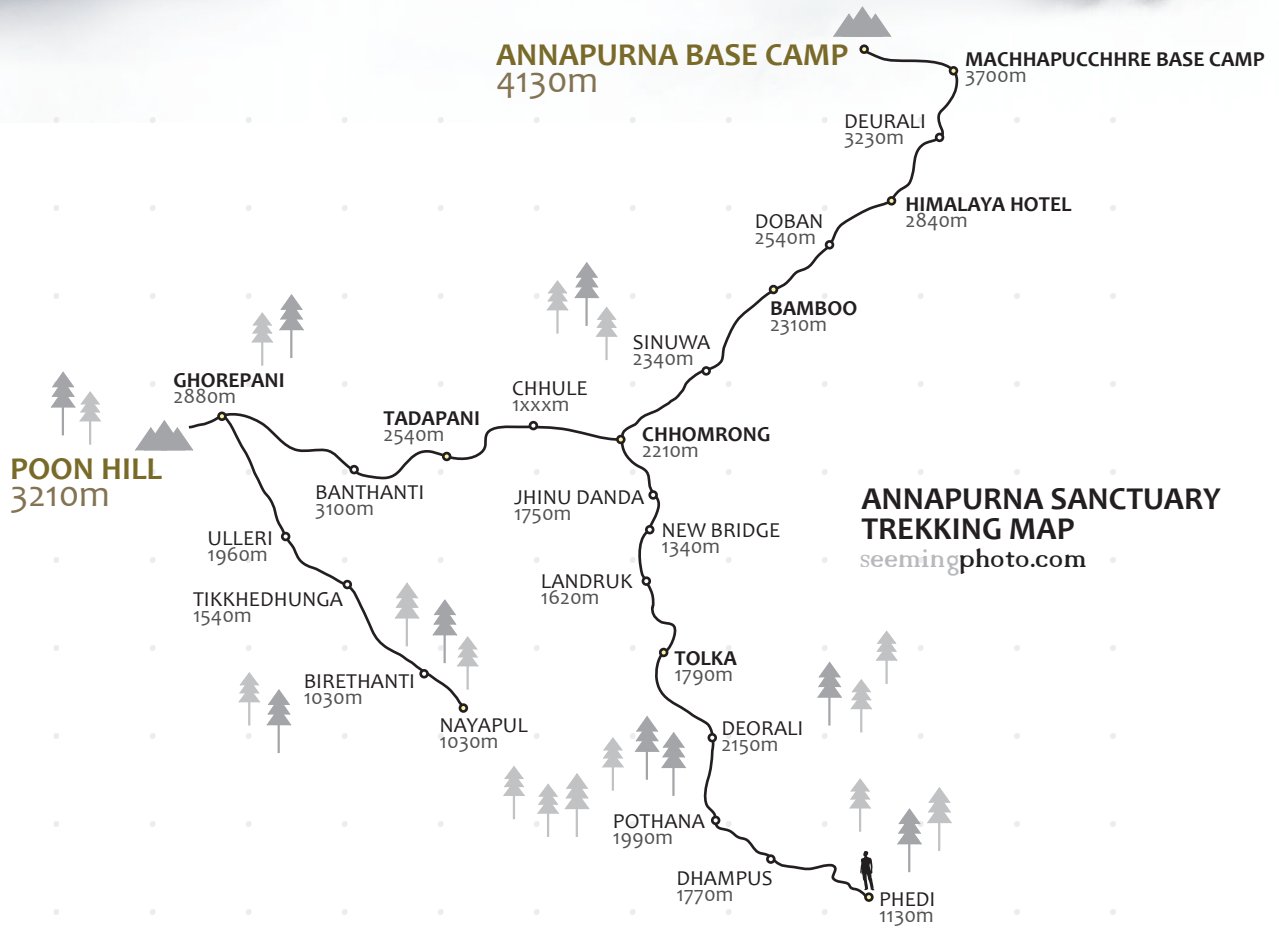
ANNAPURNA SANCTUARY TREKKING MAP seemingphoto.com